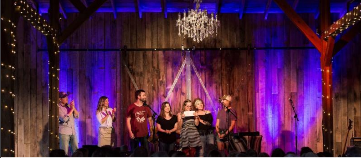
Presentation of the tips raised all summer for a total of $1,928!